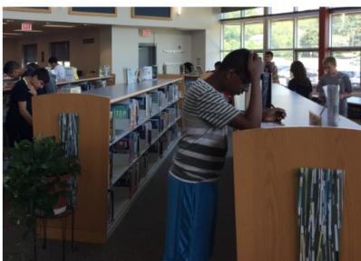
Welcome back to GCM Library!