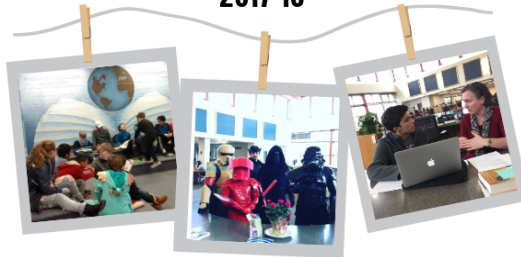
From L to R: Reading to students at Lemon Road ES, FCPL's ComicCon at GCM, working with students one-on-one.