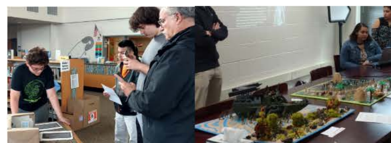
Students' World War II PBL presentations