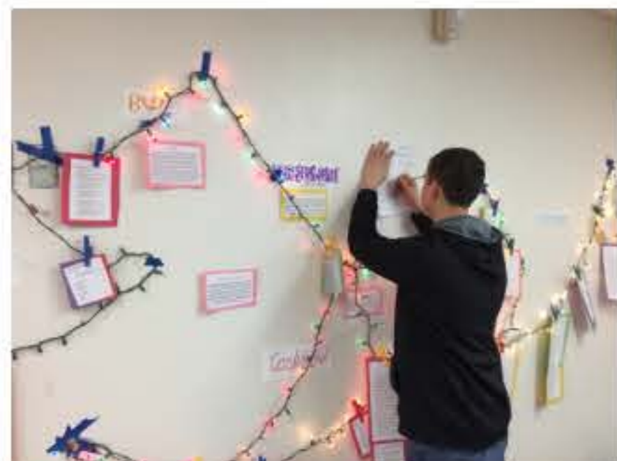
Visit to Poetry Museum