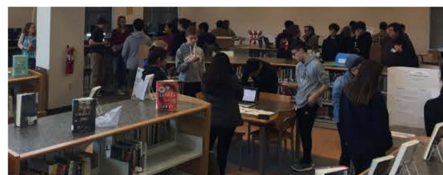
World War II PBL presentations take over the library