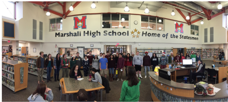
Caroling in the library.