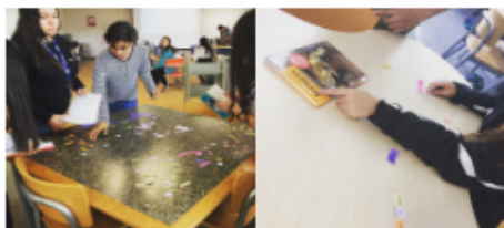
Citation Races in class

Unique student visitors 2,126 552 Average visits/day