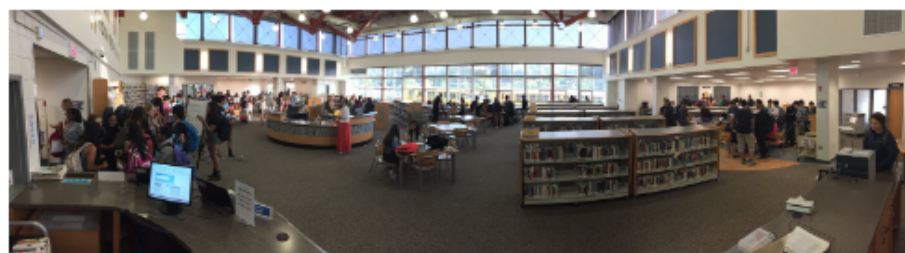
Library on the first day of school.