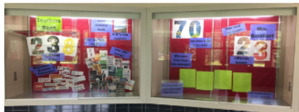
Teachers read over the summer