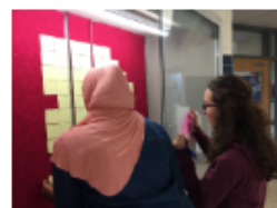
HOME students update a display